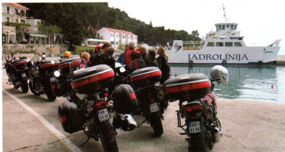
Our ferry to Hvar awaits.