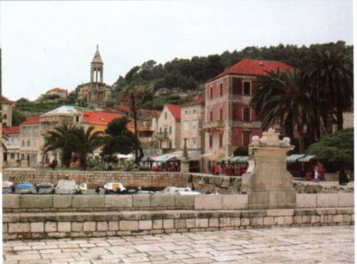
Clockwise from top: Dubrovnik's main street at night. View of the town from the waters edge. The feast on Hvar that our hosts "threw together." View of the mainland as our ferry departs for Hvar. Halfway up Sveti Jure, the tallest mountain in the coastal region. Nothing like I imagined, quite dry, looks more like Andalusia.