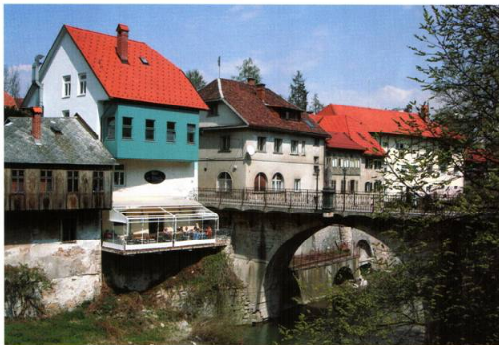
Skofja Loka is situated along a small river, this is the view approaching from the Mini Hotel.

Mini Hotel sits on a hill overlooking the ancient walled town of Skofja Loka. It is a beautiful setting, quite Alpine, and like the rentals a good deal cheaper. We were to find that just about everything here was a bargain in comparison to Western Europe.