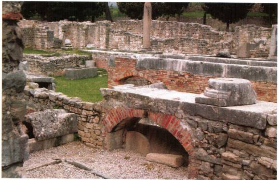
The Roman ruins at Salona.