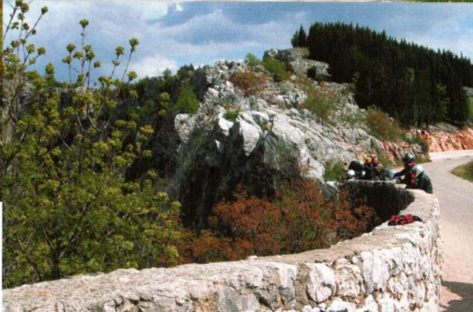
Clockwise from top: While most of the castle in Skofja Loka has been replaced, remnants of the original structure remain. Skofja Loka old town as seen approaching from the main road. Our group just across the Croatian border from Slovenia. Roadside stop, checking out the view of the Red Lake.