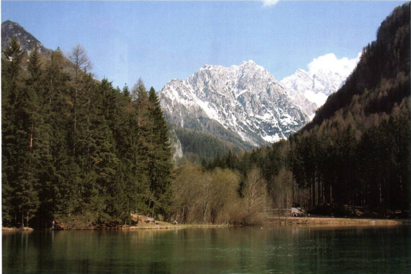
Clockwise from top: Lake and park in the Julian Alps, near the Austrian border north of Ljubljana. Roman cemetery in Bosnian town of Grad Stolac. Lovely little reflective lake in the farming region of Croatia. Our group at the Blue Lake. Picnicking at the Blue Lake park.